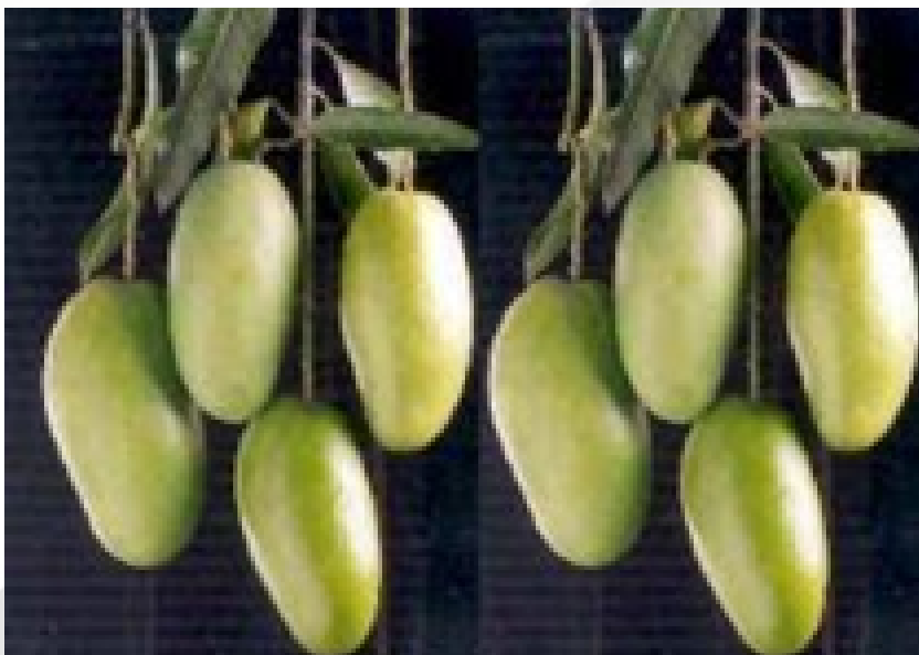
Malihabadi Dussehri (Uttar Pradesh)