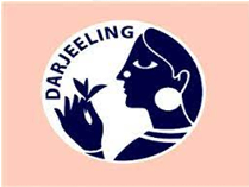
Darjeeling Tea (West Bengal)